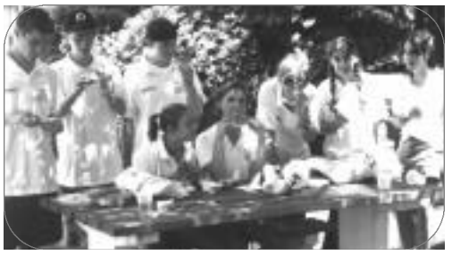
Roosevelt Summer Camp Staff, resplendent in their official T-shirts, picnic on watermelon.

Camp would not have been half so pleasant for the campers or for the