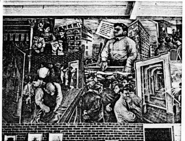
Fresco by Ben Shahn in the Roosevelt School