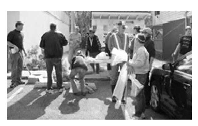
A crowd gathers to sign up for the semiannual Roosevelt Litter Pick-up'.

table and gave lost drivers direction advice while everyone else was away picking up garbage. See you all—in the fall!