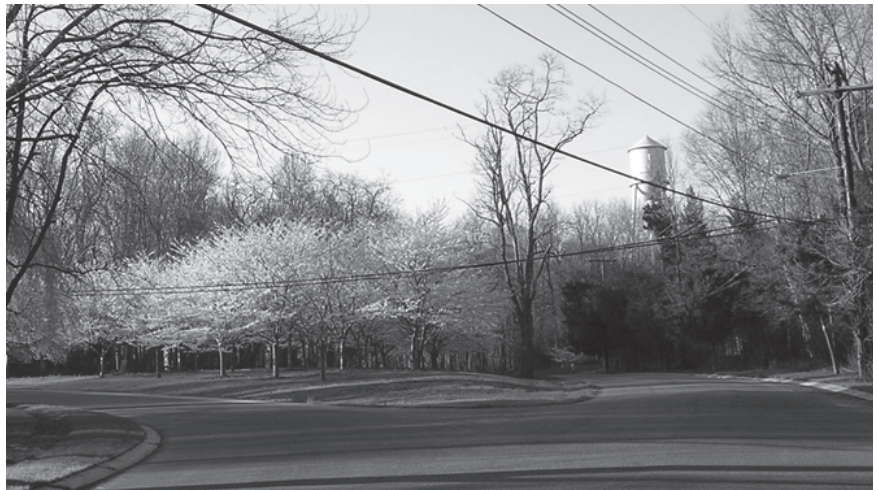
Scene from Roosevelt: North Valley Road and Homestead Lane, Spring 2004

That's all happening May 30—mark the date! ■