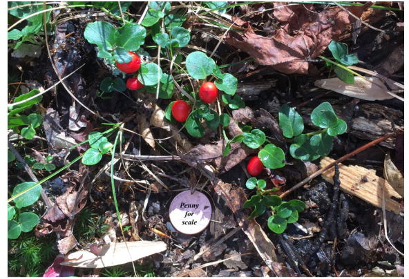
Partridgeberry ( Mitchella repens )

Partridgeberry ( Mitchella repens ) makes a great terrarium plant. It is