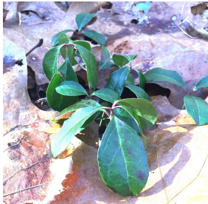
Wintergreen ( Gaultheria procumbens ) 12 Jan 2022

Wintergreen ( Gaultheria procumbens ) is a short, spreading evergreen ground-cover. It grows only four to seven inches tall. The plant may spread to cover an area of several square yards. Wintergreen is common in the eastern half of the US, except Florida, and all of eastern Canada. Also called eastern teaberry, it has many other names--unfortunately they are not unique to Gaultheria procumbens , which leads