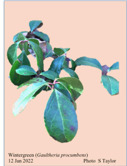
Wintergreen ( Gaultheria procumbens ) 12 Jan 2022

Wintergreen ( Gaultheria procumbens ) plants are readily available online. Besides the typical species plants, there are several named selections: Gaultheria Berry Cascade™ , Winter Splash™ (a white/pink variegated