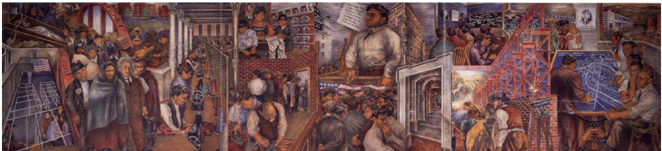
Ben Shahn’s Roosevelt/Jersey Homesteads Mural in Roosevelt Public School