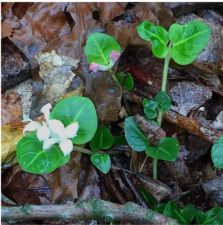
Partridgeberry ( Mitchella repens ) - 3 Jun 2020

During the winter months most of our native plants become difficult to identify. But there is one that you can easily recognize, the partridgeberry ( Mitchella repens ). During the winter, this diminutive evergreen creeper is easily recognized by its dark green leaves with pale-green veins and bright red berries. The leaves occur in pairs along the vine. It is usually found in