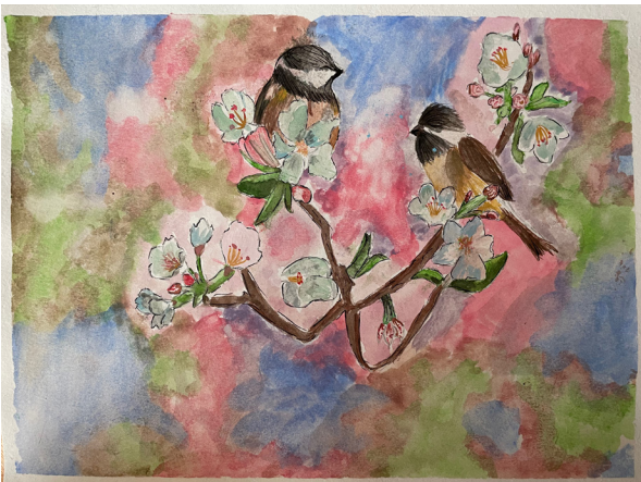
Watercolor by Sam Vo

Please park your vehicles in the right direction only. Parking on the wrong side of the street or in the wrong direction makes your vehicle difficult for oncoming traffic to see, especially in foggy or dark conditions. Vehicles parked on the wrong side of the street are subject to towing.